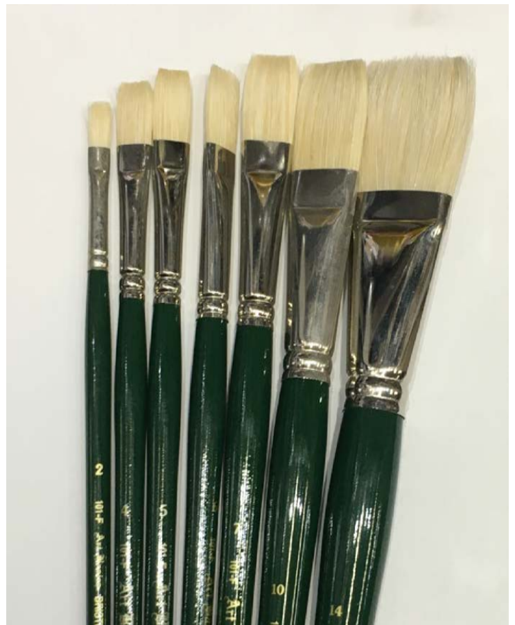
Bristle brushes - Flat or Bright