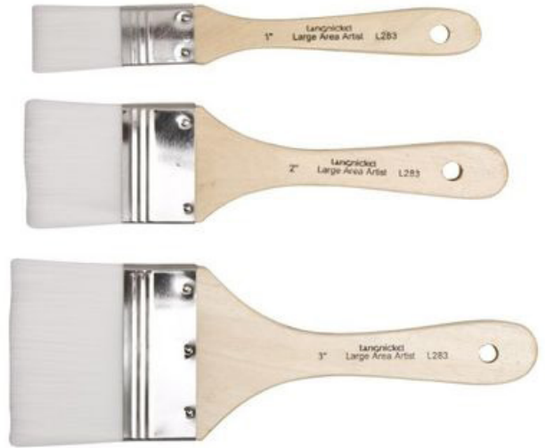
Art Basics Taklon Brush Set Flat