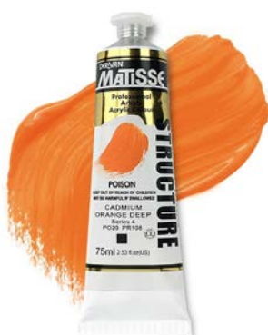
CADMIUM ORANGE DEEP

This will help your paints to stop drying so quickly! https://www.artscene.com.au/Shopping/mediums/acrylic-mediums/matisse-open-medium