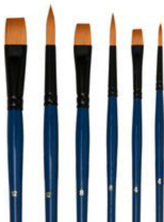
Golden Nylon Brush Set of 6

Artscene link: https://www.artscene.com.au/Shopping/brush-sets/synthetic-brush-sets/golden-nylon-brush-set-of-6