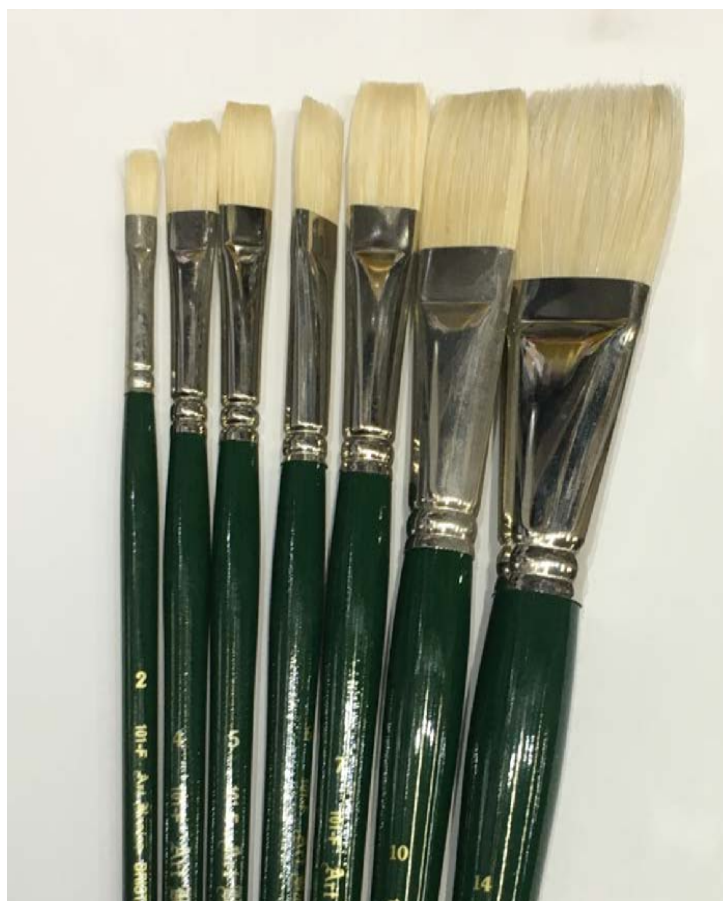
Bristle brushes - Flat or Bright

https://www.artscene.com.au/Shopping/brush-sets/hog-bristle-brush-sets/bristle-brush-set-of-5