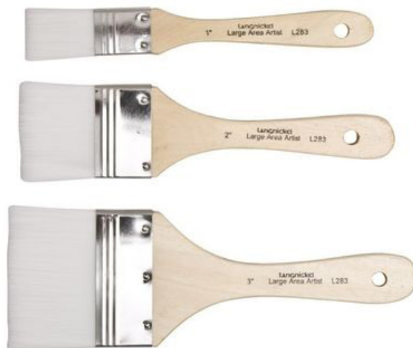
Art Basics Taklon Brush Set Flat

https://www.artscene.com.au/Shopping/brush-sets/white-taklon-brush-set/art-basics-taklon-brush-set-flat